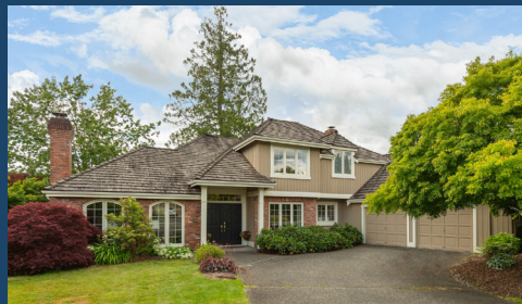
Sold in 3 days for $937,200