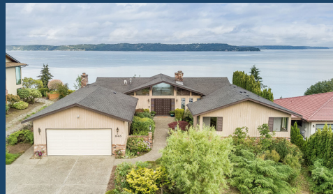
Sold in 3 days for $1,140,000