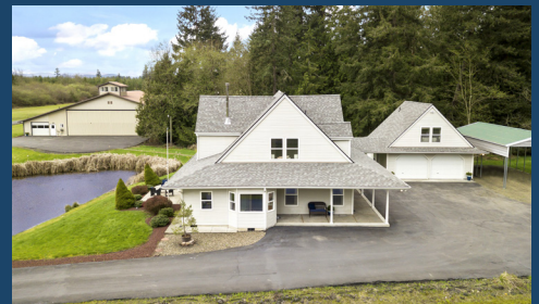
Sold for $935,000 in 6 days