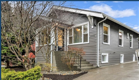
Won a bidding war at $1,101,000