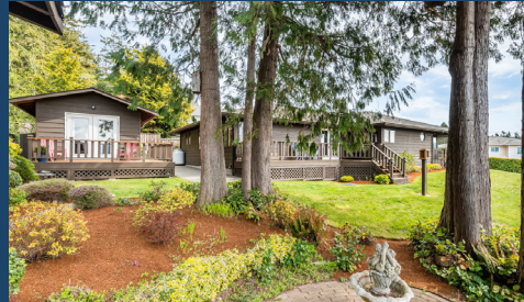
Sold in a bidding war for $1,060,000