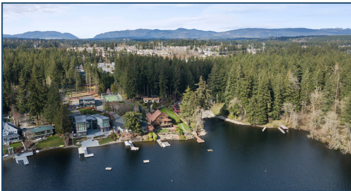
Sold in a bidding war for $930,000