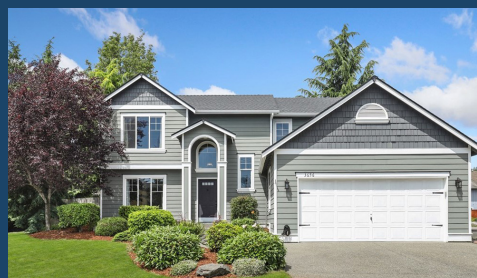
Won a bidding war - beat 7 other offers