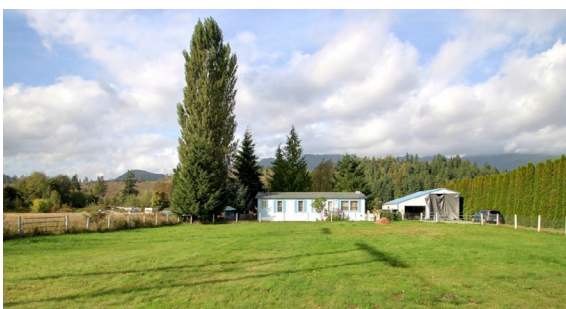
Sold for Full Price ~ $299,500