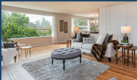
Sold in 2 Days ~ $420,000