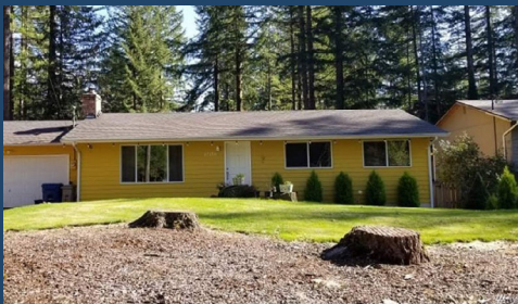
Represented the Buyer ~ $575,000