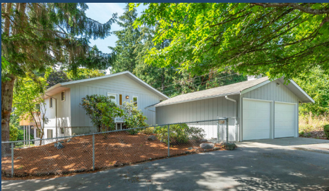
Sold in 7 Days ~ $389,000