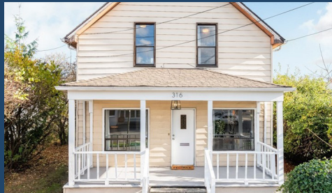
Sold in 5 Days ~ $494,900

"We were treated with professional courtesy from the very first meeting. Any questions or concerns we expressed were explained to our total satisfaction."