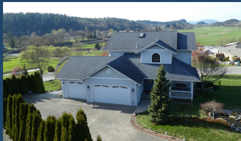
Nookachamp Hills ~ $575,000

"SASH's approach leaves no stone unturned in presenting practical and well-researched options for home sale, moving / packing needs, and other related services. Their anticipation of every possible need throughout the process and their unruffled way of solving problems along the way kept us in awe of their consistent caring, professional, and timely actions."