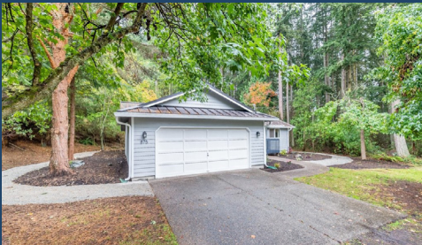
Sold Over Asking ~ $540,000