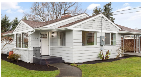
Sold Over Asking Oak Harbor ~ $465,000