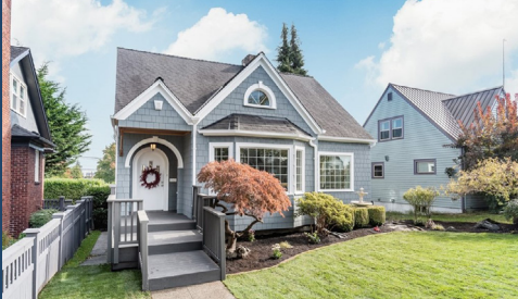
Sold Over Asking~ $735,000