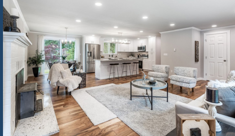
Sold Over Asking ~ $750,000