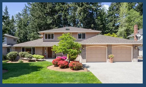
Everett Listing ~ $1,000,000